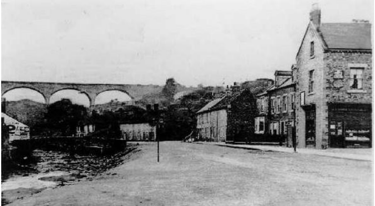
Chester-le-Street, Bridge End

Taken before 1895, when the Bridge public house was built.