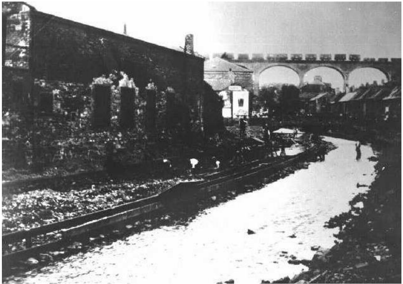
Culverting the Cong Burn, in front of the old houses known as "Canada".